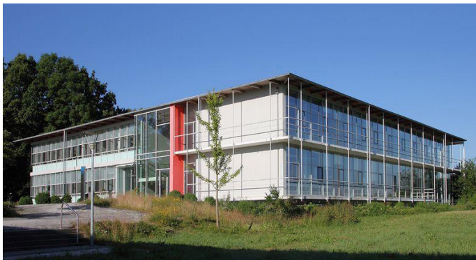
Leibniz Research Alliance Bioactive Compounds and Biotechnology